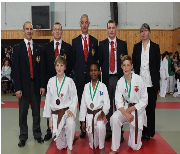
Male Cadets Kata