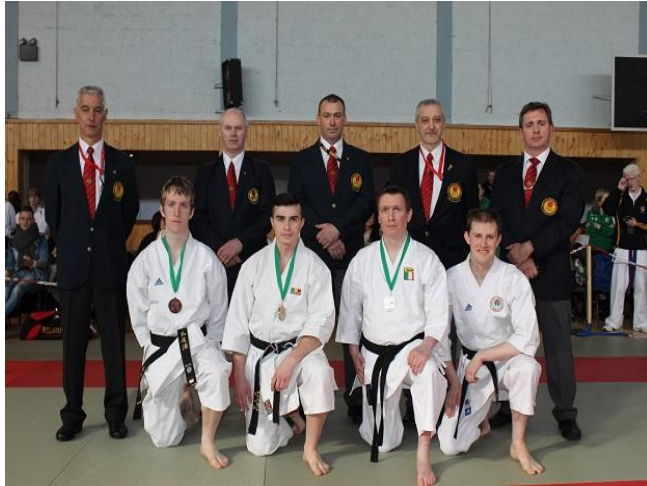
Senior Male Kata - Wado Ryu