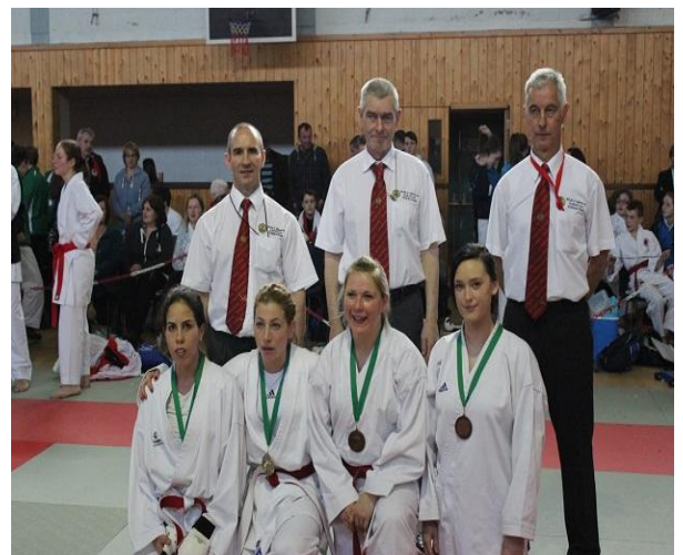
Senior Female Sanbon Kumite