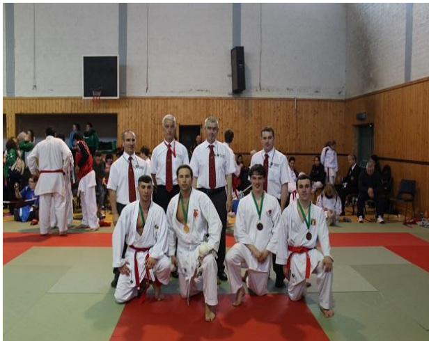
Senior Male Sanbon Kumite U75Kgs