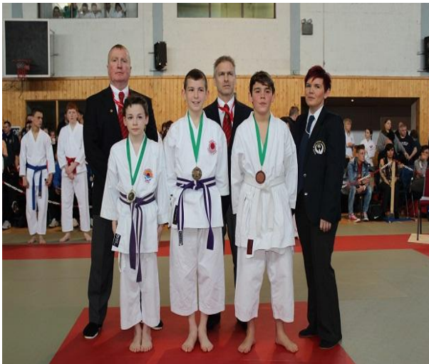
Boys' Kata 6th - 4th Kyu