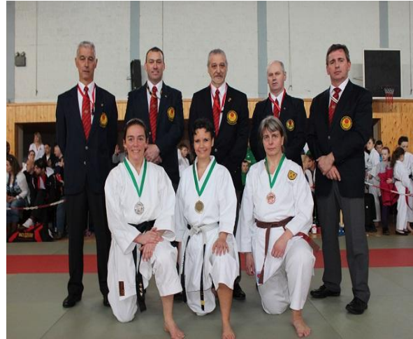
Female Masters - Other Styles Kata