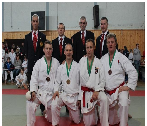
Male Masters Ippon Kumite