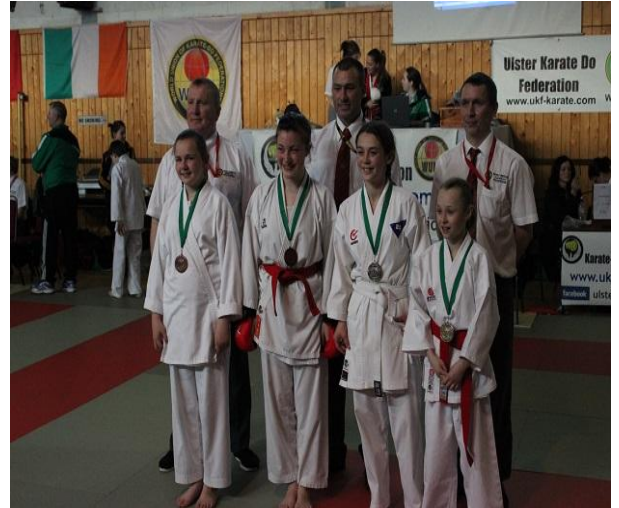
Girls' Kumite 11 - 12 3rd Kyu+