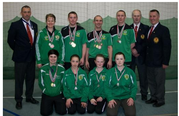
Successful WUKF Ireland members after the competition