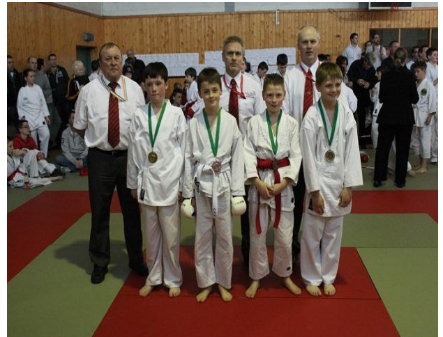
Boys' Kumite 11 - 12 9th - 4th Kyu