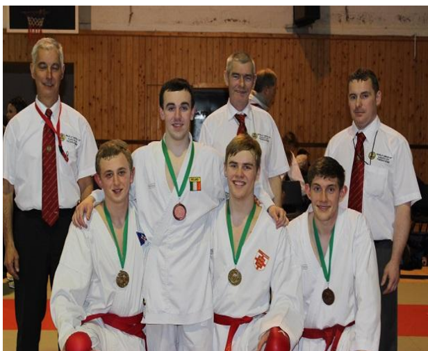
Junior Male (18 - 20) Kumite