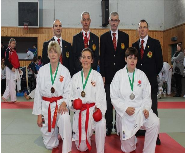
Female Masters Shobu Ippon