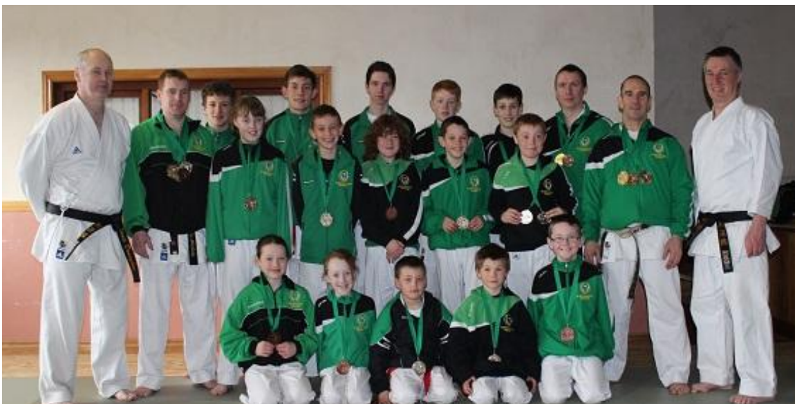
UKF Squad members who were successful at the 6 th UKF Invitation Tournament

Because of the high number of children entering the competition - their safety in relation to contact was a main focus point at the referee seminar. The competition went very well and all of the visiting Federations paid tribute to the high standard of the competitors and the fairness of the referees. Behind the scenes, the Tournament Officials who kept the scores, managed the Computer Scoring systems, and who looked after the children all deserve thanks. It was a busy day for all officials and the management of 79 Categories went without a hitch. The Senior Male Sanbon Kumite and the Senior Male Ippon kumite were well contested by all Federations. Overall, it was a very successful day and all Federations made it on to the medal table. The UKF itself achieved Gold in 16 events, Silver in 14 events and Bronze in 18 events. Well done to all who took part. The 7 th UKF International Invitation is scheduled for Saturday 5 th April 2014. ☺