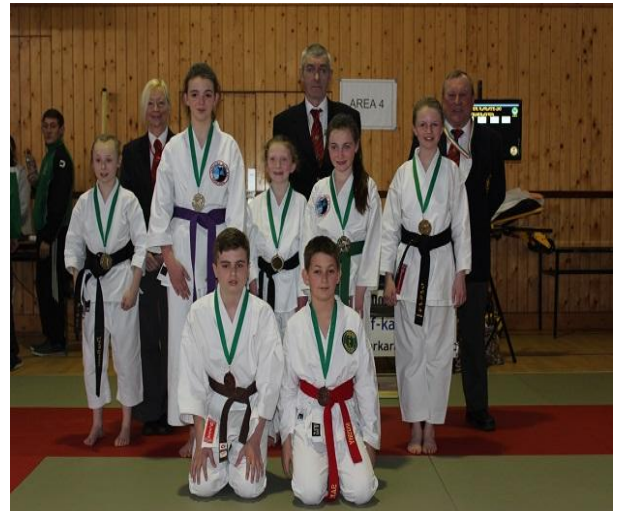
Children Team Kata